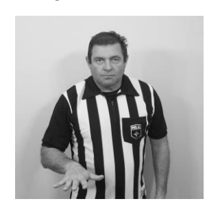
Loose Ball Push