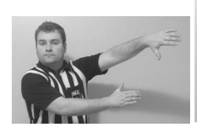
Shot Originating Behind GLE