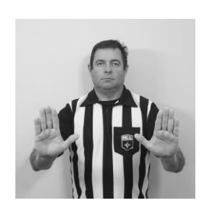
Checking from Behind