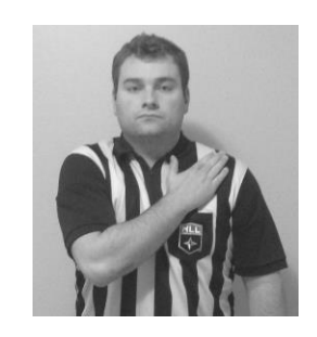
Illegal Body Check