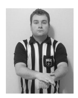
Withholding the Ball