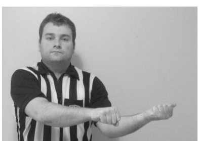
Holding the Stick