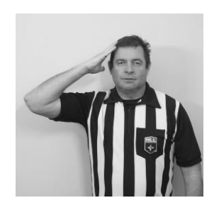
Dangerous Contact to the Head