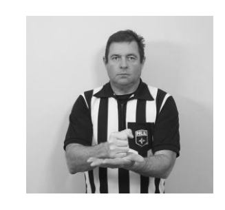
Intentional Dead Ball Contact